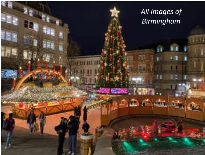
All Images of Birmingham

If you ever wondered where the friendly folk of Frankfurt went after Leeds, we can tell you they are very happy in Birmingham. The Frankfurt Christkindelmarkt was a regular feature in Millennium Square, Leeds for many years. The sellers could not make the trip in 2020 because of Covid. The market was also cancelled in 2021. In 2022 Leeds City Council said 'the market was no longer feasible'. It is far more likely they got a better offer from Birmingham. The Council there promote it to the max and it does not disappoint. They have a much larger space in England's second city. And the backdrop of Birmingham Town Hall and other buildings is spectacular. The atmosphere is fantastic with many people enjoying the Gluhwein in the early afternoon, when the Editor visited. Leeds is still way behind most English cities in football, transport and promoting itself to visitors. There has been no noticeable improvements in recent years despite £millions spent. The fact they closed their Visitor Information Centre says it all.