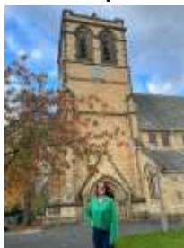
Parents of a B Spa Primary School launch children's community art competition