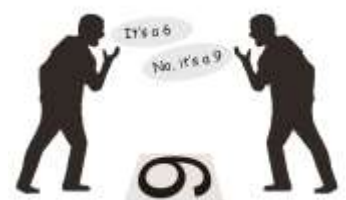
Listen to Both Sides

Everyone mentioned in the WFP has a right to reply. The reply will be published unedited.