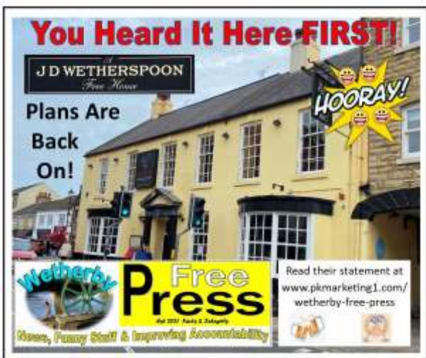
Your Community Newsletter told you the fantastic news before anybody on social media