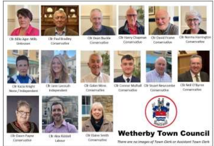
Wetherby Town Council There are no images of Town Clerk or Assistant Town Clerk

All but one of the 9 Council reps on other organisations are Conservative.