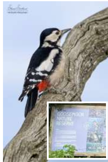
Goosemoor Nature Reserve nr Cowthorpe is run by volunteers and a wonderful place to relax and watch an amazing variety of wildlife.