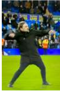
Celebrating Win v Boro