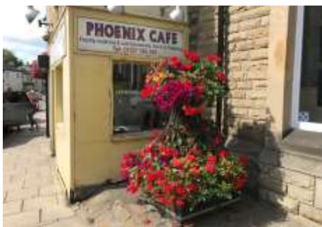
They are always in need of volunteers so please help if you can. Sue Turner - Contender for our Townsperson of the Year