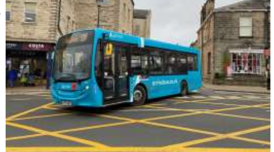
The New Box Junction in Wrong Place

Nobody to our knowledge has complained about vehicles exiting Castle Gate. As a frequent passenger and car user on that road, the Editor has never experienced a problem being let out onto the main road. Particularly as traffic is slow and there is a Pelican Crossing nearby, stopping traffic frequently. Where is the evidence of 'consultation' over the new box junction? There wasn't any that we know of. The silence on this matter from Councillors and lack of detail in the City Council statement makes us think they are trying to cover up this large mistake.