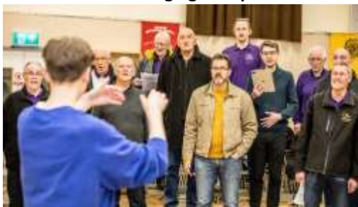
Friendly Spirit of Harmony group always welcome new members - no experience required