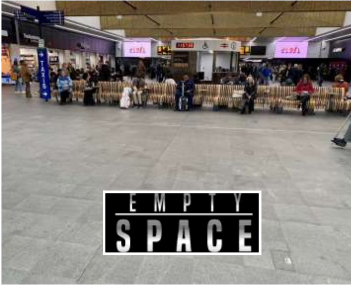
Leeds Rail Station - Why Not Use this Space for a Model Railway?

The Editor is fortunate to be able to travel around the country and abroad. He sees many things and often thinks 'what a great, simple idea, why can't we have that?' After yet another refurbishment at Leeds rail station, there is a big empty space that could be used.