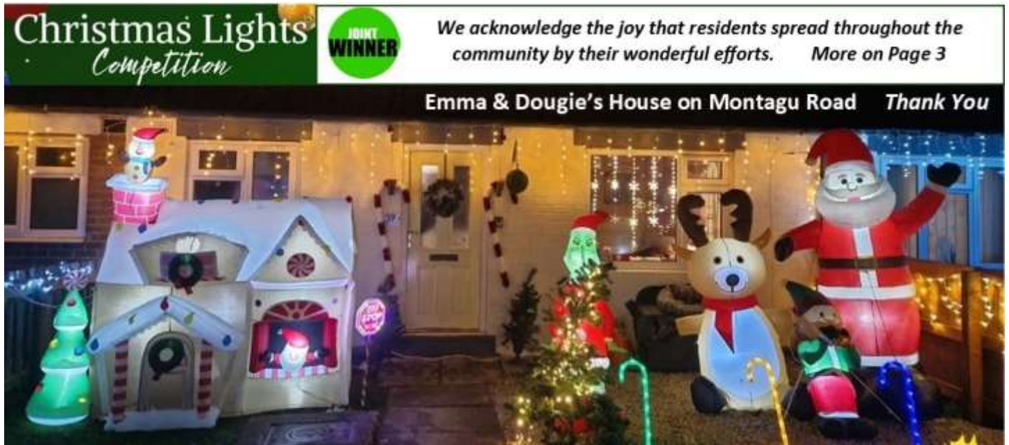
Our Competition Last Year Attracted Much Interest and Admiration

This time last year we had a Christmas Lights competition. It was to thank those people who, at their own expense, make the dark winter days and nights a little bit more cheerful for all of us but especially children.