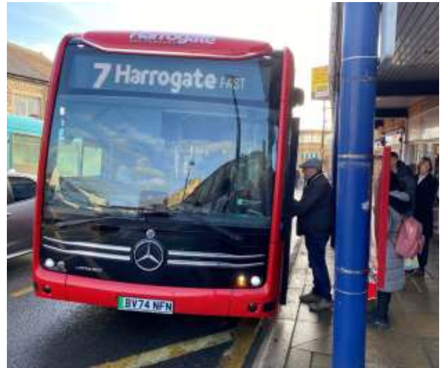
The new Mercedes Benz electric buses are months later than promised but very welcome indeed. Old buses still on route too.

The 412 to York will run on these dates without the 6.40 from Wetherby & the 18.35 from York