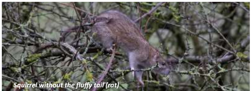
Squirrel without the fluffy tail (rat)

More stunning images of the diverse wildlife at the reserve near Cowthorpe. Check out their Facebook page for an amazing video of a Kingfisher with a newt in its mouth. If you have not visited the reserve yet, you are missing out. It is a peaceful place to sit and watch some amazing wildlife. Not just an incredible variety of birds but also bats, bugs, newts and moths & butterflies (and rats!). They always welcome new volunteers if you would like to help out.