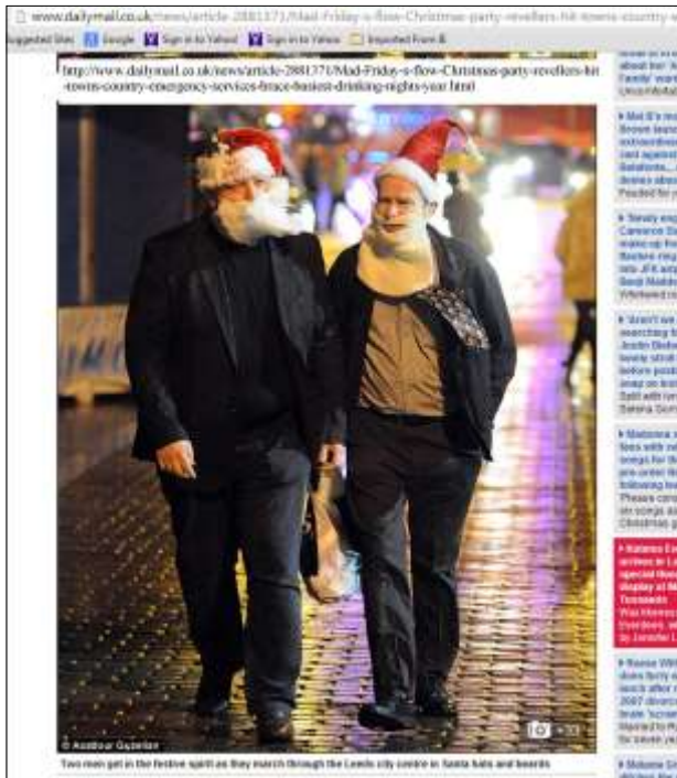
The Editor on the right caught by a Daily Mail photographer a few years ago

Please Donate Online to Cover Printing Costs