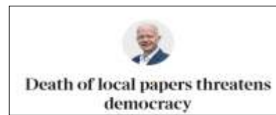
In an article in The Times , Conservative Yorkshireman William Hague expresses his fear for local accountability and democracy as local media continues to decline