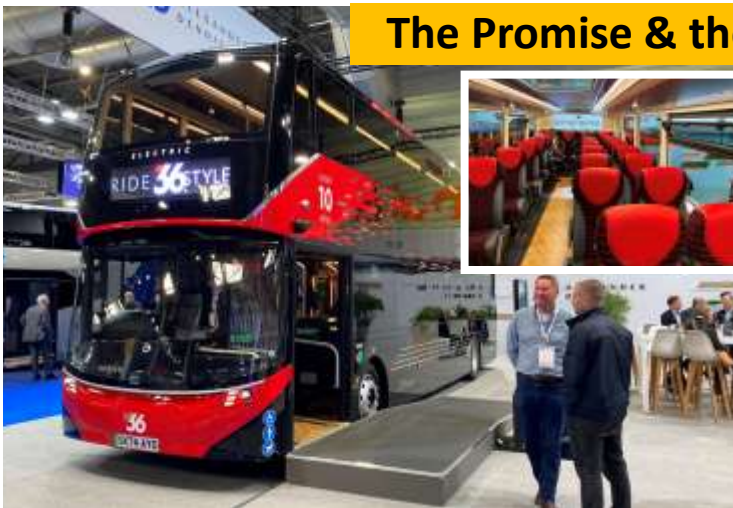
New Electric Harrogate Bus Co Buses at Birmingham NEC Bus & Coach 2024