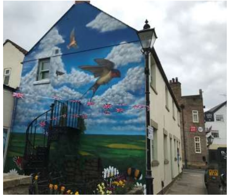
Beautiful Works of Art in Harehills (above) and Knaresborough (right)