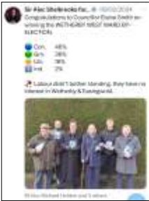
Not political !!!

We thank the 15 Wetherby Town Councillors for being unpaid volunteers. Unlike most volunteers they have power and are responsible for spending over £500,000 of our money. Most are Conservative and raised our Council Tax precept by 80% in a cost-of-living crisis in 23/24, much of it to pay for new staff.