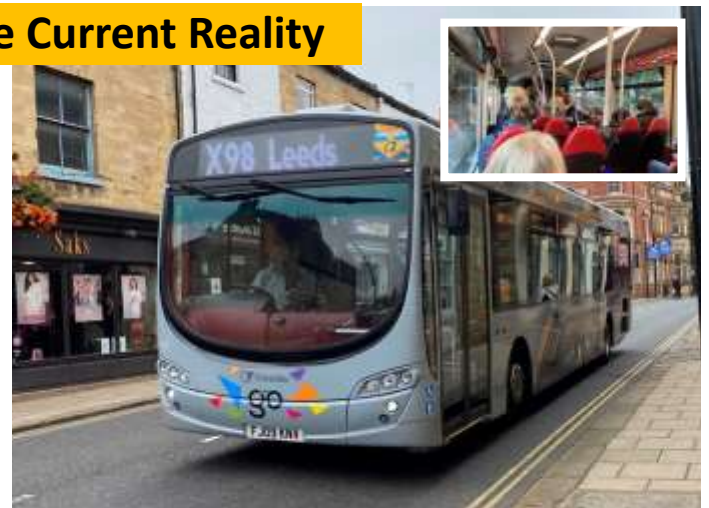
Old Single-Deckers on X98/99 route overcrowded on peak journeys

We were promised the double-deckers from the 36 route 'later this year' for the X98/99 route to Leeds. It hasn't happened yet. A driver told us not to hold our breath, as the single-deckers for the 7 route were months late and they are having problems with the charging points at Harrogate bus station. That means the new electric buses for the 36 may be in service later than planned.