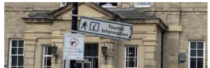
This useless incorrect sign for visitors has been outside the Town Hall for years