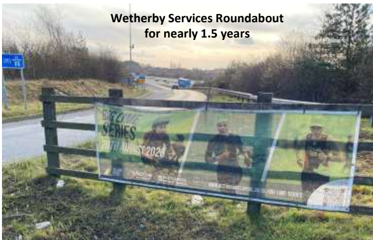
Wetherby Services Roundabout for nearly 1.5 years

Let's turn this pelican crossing box into something to admire!